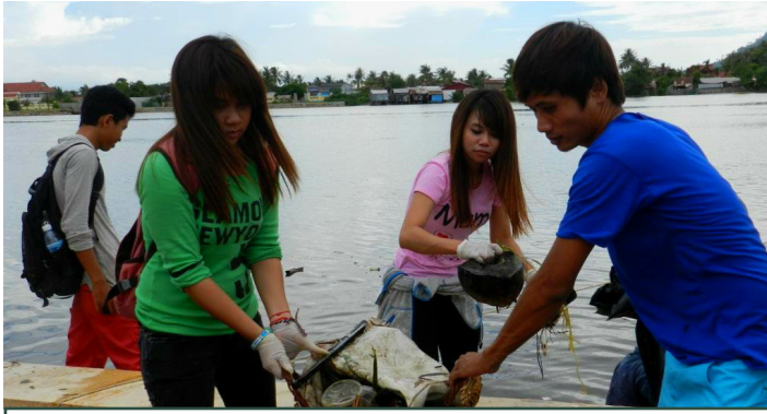
PUC students were collecting trash from the river in Kampot.

One hundred students of Environmental Sciences from Paññastra University of Cambodia (PUC), moved along with their teachers on July 16, 2014 to Kampot province where they were picking up trash from Kampot River and giving talks to the public about the importance of protecting the environment.