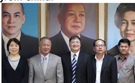
Delegates from China with PUC faculty members taken picture together.

A delegation from the First Institute of Oceanography (FIO), The State Oceanic Administration (SOA) in China visited Paññāsāstra University of Cambodia (PUC) to talk about a cooperative relationship between the two schools.