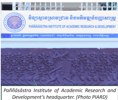
Paññāsātra Institute of Academic Research and Development's headquarter.

Paññāsātra Institute of Academic Research and Development (PIARD), held its first Board meeting on February 24, 2014 since its official registration with Ministry of Interior as a NGO on November 13, 2014. This meeting aimed to address certain points regarding its activities and accomplishments, and to discuss the challenges and future plan among