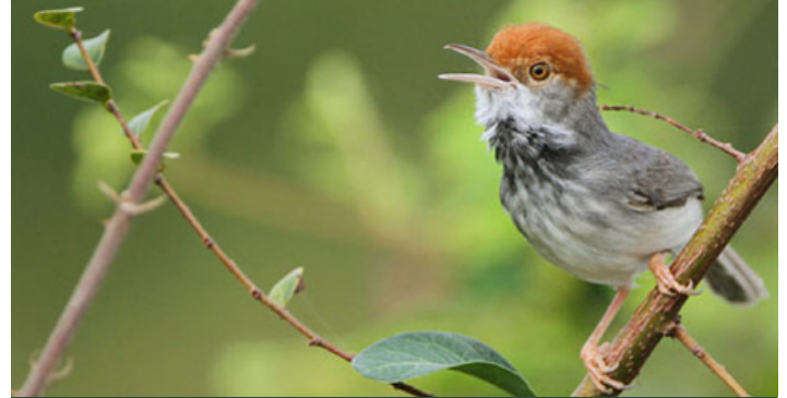
Cambodian Tailorbird or Orthotomus chaktomuk